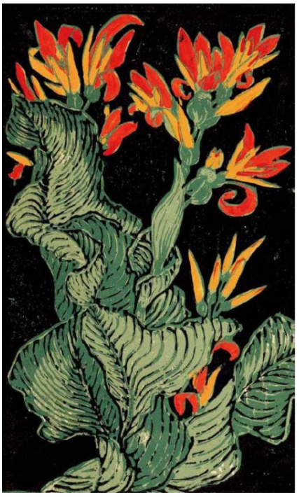
Fig.5 Border Flowers (the Second Painting in Series of Paintings) (the Picture is from Luo Yingqiu Art Research Network)

Ideology and the times are the creative themes that Luo Yingqiu closely focuses on when creating printmaking works, Chen Qiwei said, "I think Mr. Luo's prints pay great attention to the ideological nature of the theme and keep up with the times. He doesn't do anything romantic. One of his works is called Border Flowers (Fig. 5). Although they are wild flowers, they are very sunny and have a firm will to survive." Luo Yingqiu's chromatic woodblock work Border Flowers , created in 1962, is 17 cm long and 29 cm wide. The picture mainly depicts lush wild flowers. Through the description of wild flowers, Luo Yingqiu shows resolute vitality, inspired student Chen Qiwei and inspired the people at the same time.