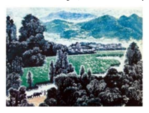
Fig.3 -2 Hakka Mountain Village

The watermark and chromatic woodcut work Hakka Mountain Village (Fig. 3-1 and Fig. 3-2), created by Chen Qiwei in the 1980s, is also depicted around the Hakka rural scenery. The work is 60cm long and 42cm wide. It is printed one version with warm and cold colors respectively. The picture depicts lush trees around the houses where people live, and there are villagers passing by cattle herding on the rural path. It shows the pleasant scenery in the countryside and the leisurely and complacent scene of people. Comparing the expression forms of trees in Luo Yingqiu's Colorful Hakka Village and Chen Qiwei's Hakka Mountain Village, it is not difficult to see the similarities between the two. Chen Qiwei has created many works full of local flavor through extensive study and reference to Luo Yingqiu's expression methods of trees and the treatment