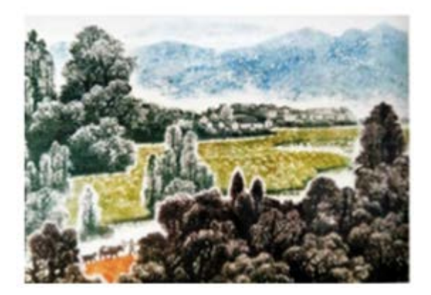
Fig.3 -1 Hakka Mountain Village